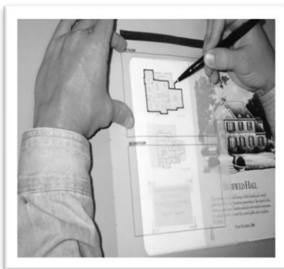
2) Sketch your ideas or bring photos