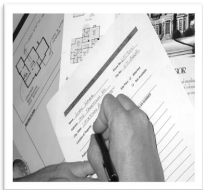
1) Fill out the attached form