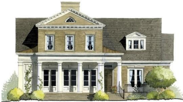
Front Elevation Renovation

Creating a home with architectural integrity and owner-specific features is not restricted to a from-the-ground-up, custom design approach. At Stephen Fuller Inc., we bring our signature style and passion for architectural character and detail to homes in need of enriching - preserving and drawing inspiration from their assets, while helping homeowners experience a new level of design quality and discover the potential in their existing home.