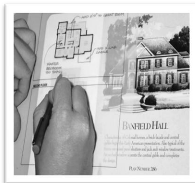
3) All notes are helpful to us